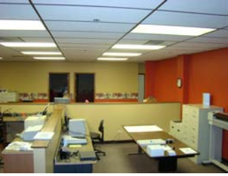
Printing Copying Sign Making Area