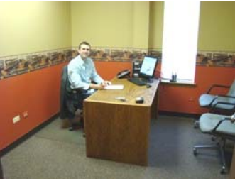
Reception Area / Room