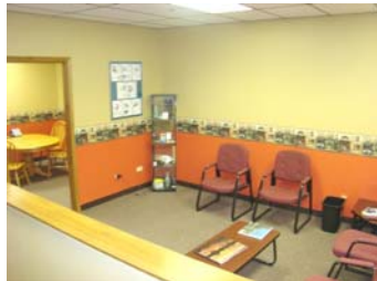
Engineering / CAD Area