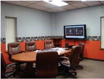
Second Conference / Video Room