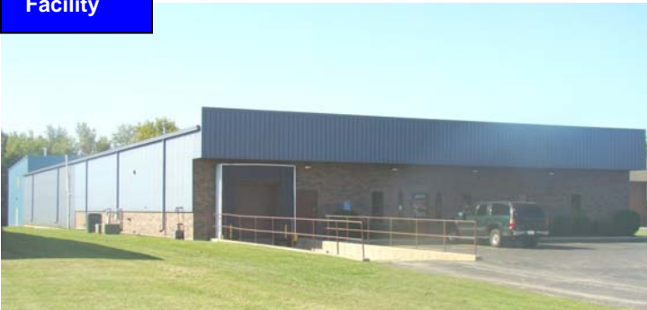
25,000 sq ft Industrial Building