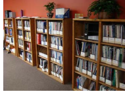
Technical Catalogs / Reference Center