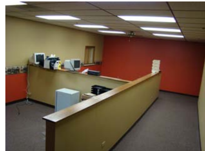
Sales / Marketing Area