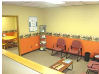
Engineering / CAD Area