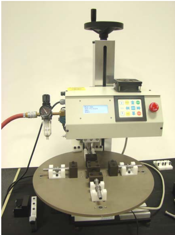
Machine tool quality construction

The Kwik-Dex programmable indexer is used to streamline your production by indexing parts to the marking area of the marker. This allows an operator to load/unload the dial while the machine is marking. Make your own dial or order from us.