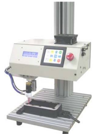
KM with dispenser valve Ideal for automating that tedious and messy manual dispensing application.