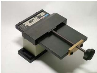
Mini Vise Tool steel construction with full support. Ideal for name tags and small parts.