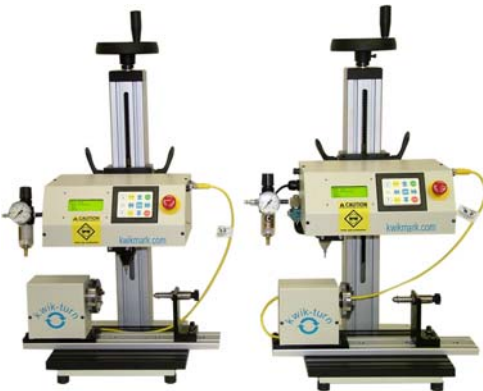
Kwik Turn Rotary Attachment One component operates as a cylindrical fixture and an indexing head.