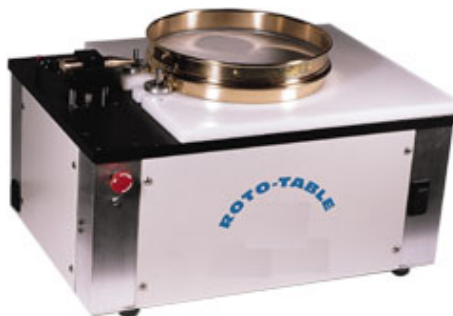
Ring / Flange Marking System Custom solution for larger parts that do not lend themselves to the traditional equipment.