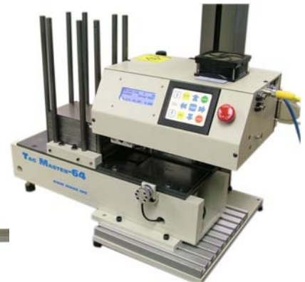
Tag Master 64 Name Plate Feeder ideal for high volume production