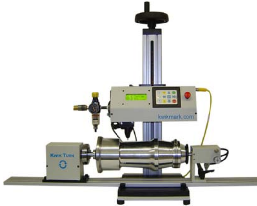
KM with Pneumatic Kwik Turn Automatic rotary axis with a pneumatic tailstock to clamp parts. No tools req'd.