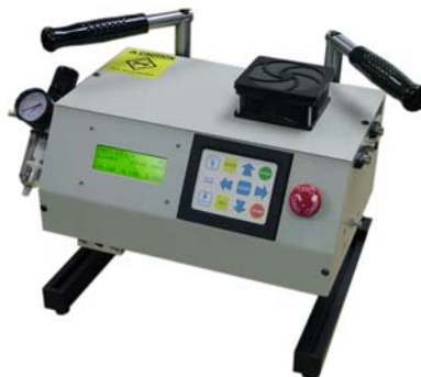
KM with Port-A-Stand Adaptor Mounts to the standard KM head for portable On-The-Go marking requirements.