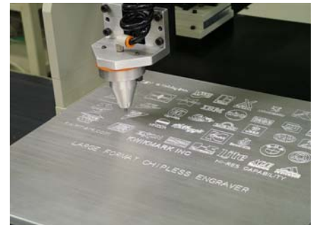
Large Format Marker Standard 12" x 15" or 24" x 15" travel area. Available in up to 4ft x 8ft travel area.