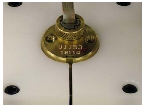
Cylinder lock / key Clamp Fixture Combines marking matched sets keys and locks