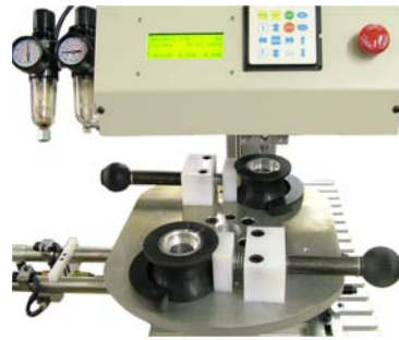
2 Position Indexer Affordable automated 180 degree index with locking fixture nests