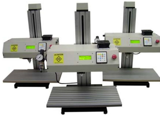
Programmable Z Axis & 12" X Stroke Entire column is programmable for multi-level marking.