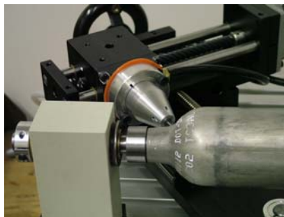
Hi speed Cylinder Marker Unique high speed head marks round, angular and spherical surfaces all @ once.