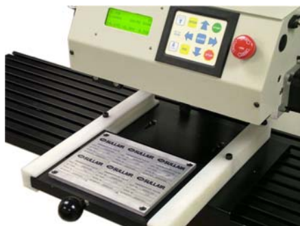
Nametag Nest Quick slide in nest streamlines manually loading the system. Adjustable for size.