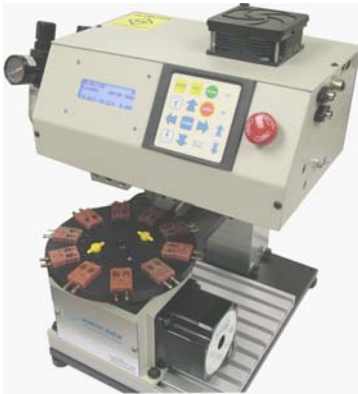
KM with 10 Station Indexer Programmable # of stops to suit almost any application. Controlled by system.