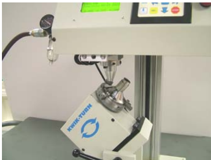
Available Sine (Angle) Mount Adjustable angle sub base adds versatility to the Kwik Turn head.