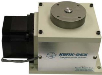
Kwik Dex Programmable Indexer Programmable # of stops to suit almost any application. Controlled by system.