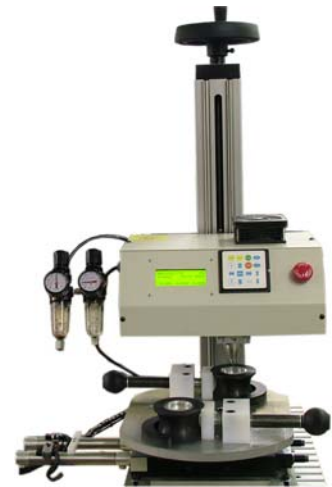
Two Position Dial Indexer Streamlines the operator load / unload task with a removable dial & automatic operation.